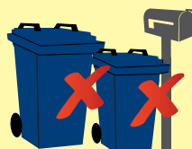
Objects & Carts Too Close Together