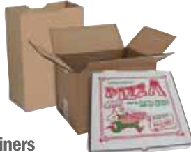
Cardboard, Pizza Boxes & Paper Bags Flatten cardboard & cut into pieces. Remove wax paper from pizza boxes