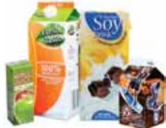
Food & Beverage Containers Empty containers only