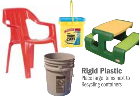
Rigid Plastic Place large items next to Recycling containers