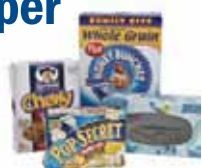
Paperboard All types & sizes