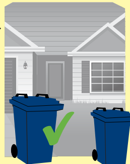
Place Wheels of Carts Toward House

Like us on Facebook for Recycling Tips & Info facebook.com/ModernDisposal