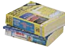
Phone Books All types & sizes